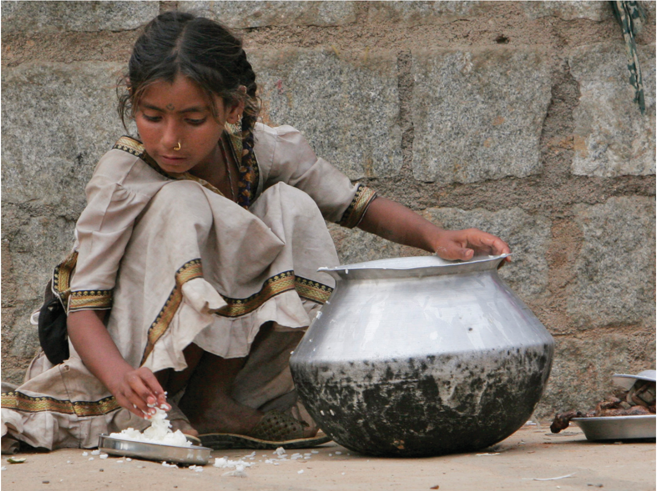
Figure 12.1: Girl children are denied their human rights in many countries. This girl in a Bangalore, India, slum may face not only economic hardship but discrimination and exploitation because of her sex.