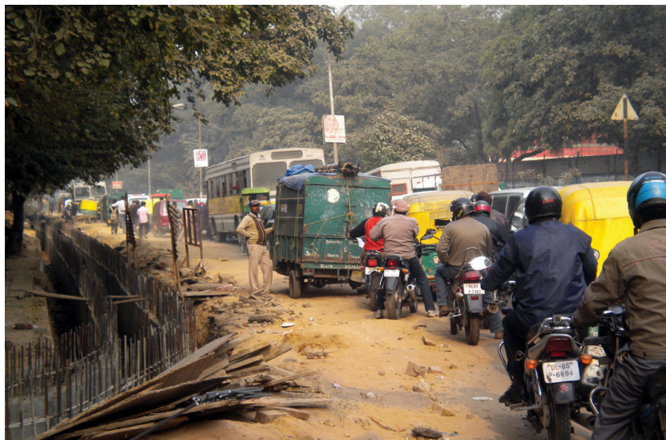
Figure 9.6: Women identified the lack of pavement as severely restricting their mobility and adding to their fear of violence in this area of New Delhi.

“In all the cities, women face fear. They are fearful of sexual harassment, of sexual assault. Across the cities, women say they try to avoid getting out at night. The moment it becomes dark, the city becomes a more hostile place for women. Women say using public transport is a problem,” states Dr. Kalpana Viswanath, project coordinator. “This clearly indicates that women are not equal citizens of the city, they are not able to equally access what the city can offer.”