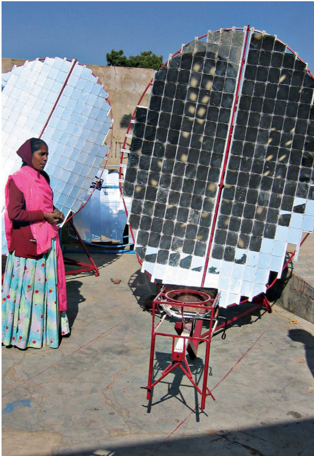
Figure 11.6: Sita Bai, a solar cooker mechanic, stands beside one of the devices she is trained to assemble and repair.

notebook. Since there is no one common language among the trainees or instructors, the women learn to identify parts by color and use hand gestures liberally. Waves, smiles and greetings in a variety of languages welcome the visitor to this Barefoot united nations of women, collaborating to bring light and hope to their communities.