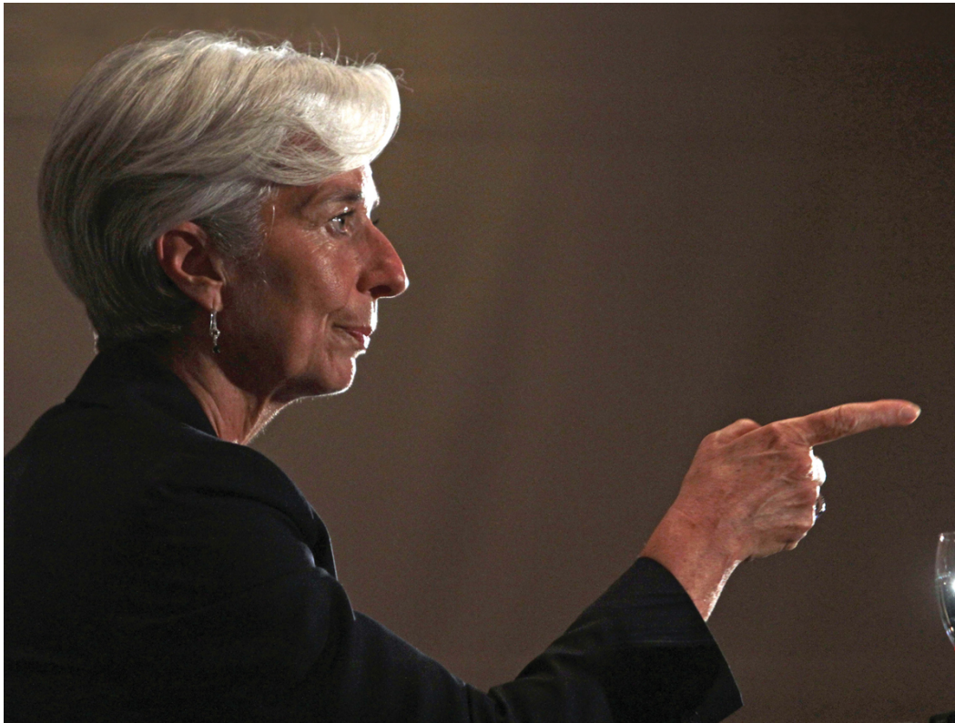
Figure 8.1: The International Monetary Fund Managing Director Christine Lagarde is among the dynamic women who lead the way for women in traditionally male-dominated institutions. Government and nongovernment agencies can promote the achievement of mainstream gender equality.