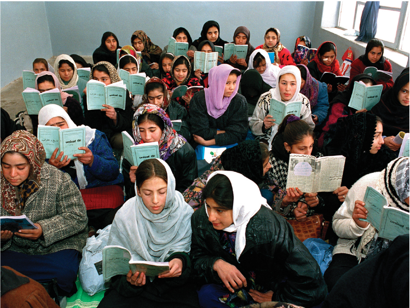
Figure 2.1: Few investments have as large a payoff as girls' education. Educated women are more likely to ensure health care for their families, educate their children and become income earners. The Zarghuna Girls School in Kabul, Afghanistan, depicted here, is supported by the United Nations Children's' Fund (UNICEF).