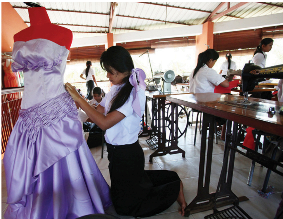
Figure 9.4: Somaly Mam, former Cambodian sex slave and founder of a rescue organization, works at a dressmaker's shop that employs rescued girls.