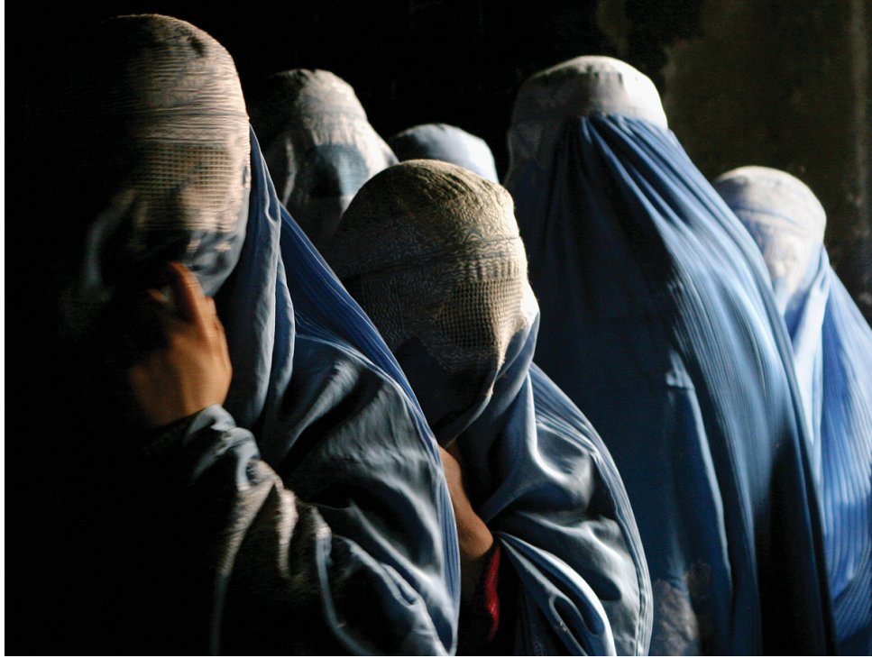
Figure 9.1: Some countries still fail to accord human rights to women. Afghan women are among those to whom nongovernmental organizations offer assistance because of widespread abuse.