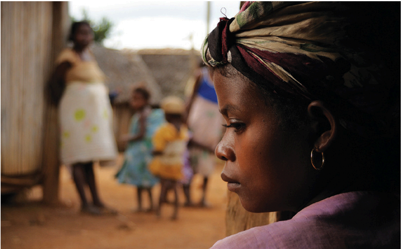
Figure 3.3: Partnerships between local groups and international organizations provide health care and counseling for pregnant women and new mothers in Madagascar

Improving women’s health starts by recognizing that women have different needs from men and unequal access to health care. Focusing a “gender lens” on health services is necessary to reveal and address the inequalities between men’s and women’s care. This means paying more attention to girls, adolescents and marginalized women who suffer from poverty and powerlessness and changing the attitudes and practices that harm women’s health. Also, men should be partners in promoting women’s health, in ensuring that sex and childbearing are safe and healthy and in rearing the next generation of young leaders — both girls and boys.