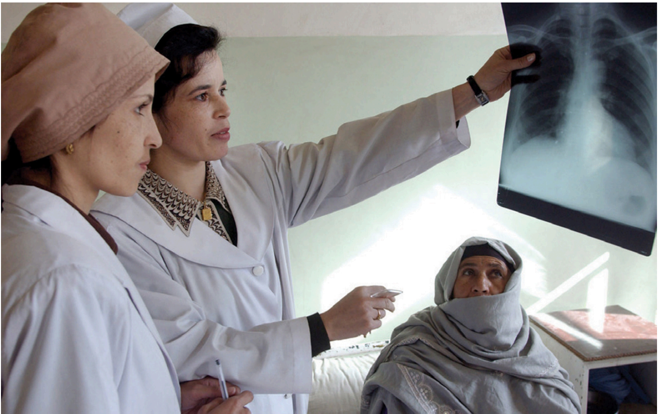
Figure 3.2: Two Afghan doctors examine a patient’s x-ray at Rabia Balkhi Women’s Hospital in Kabul, Afghanistan.

Pregnancy and childbirth take a heavy toll on women’s health in the developing world. According to 2010 estimates by the World Health Organization (WHO), 358,000 women die of preventable causes related to pregnancy and childbirth every year; 99 percent of these deaths are in developing countries. In contrast, in developed countries where women deliver their babies in hospitals and have access to care for pregnancy complications, maternal deaths are extremely rare.