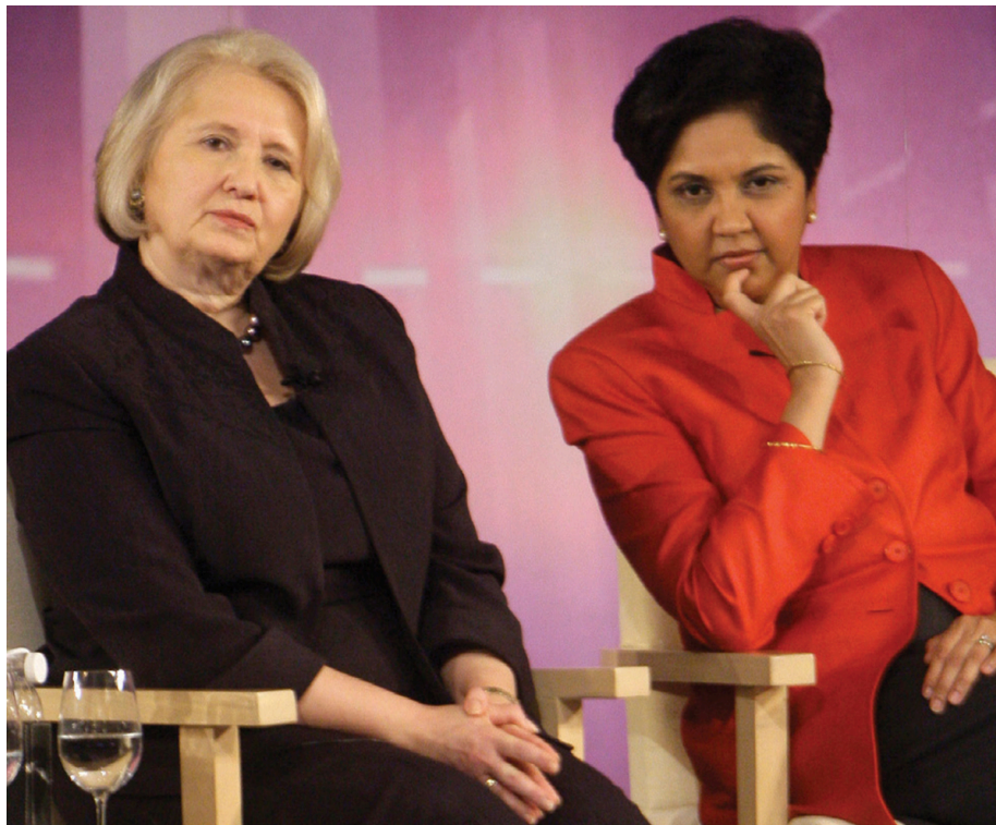
Figure 0.3: Melanne Verveer with PepsiCo Chairman and Chief Executive Officer Indra Nooyi.

MV: We still have an agenda to complete. We have to be more creative. One of the challenges is to bring new tools to the table, tools that do a better job enhancing economic progress. Microcredit is one of the great financial tools, but we need broader financial inclusion: savings and other ways that poor people can be insured against cataclysms of one kind or another. Financial tools can bring creative solutions, as can technology. I personally think that mobile technology has the potential to be as transformative as microcredit has been. Cellphones are more accessible to the poor. Cellphone applications are being developed to help improve health care. The cellphone is being used for banking, teaching literacy, safeguarding women from violence and creating economic opportunities.