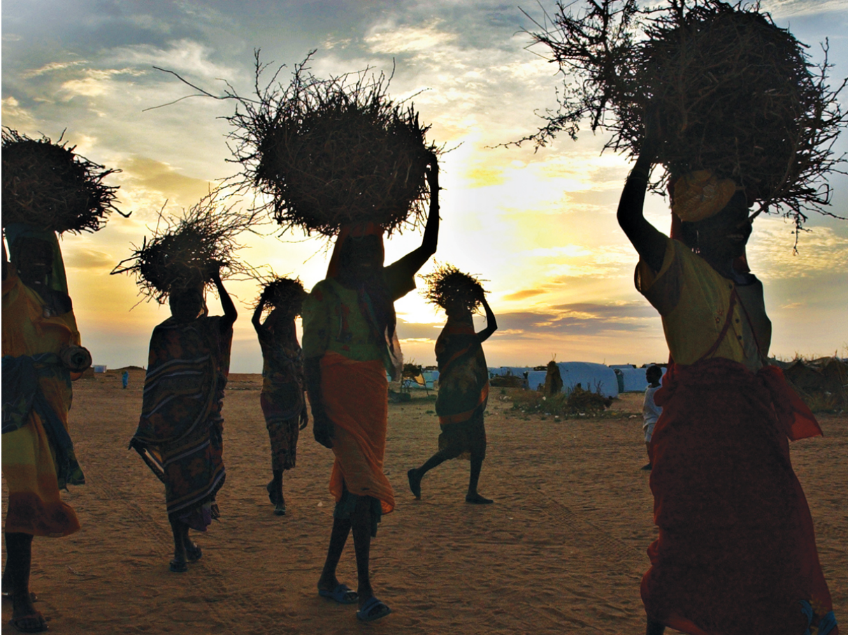
Figure 11.1: Because of women's relationship with the environment, they can be critical agents of environmental conservation, sustainable development and adaptation to climate change. In Darfur, Sudan, women carry firewood to the Abbu Shouk refugee camp.