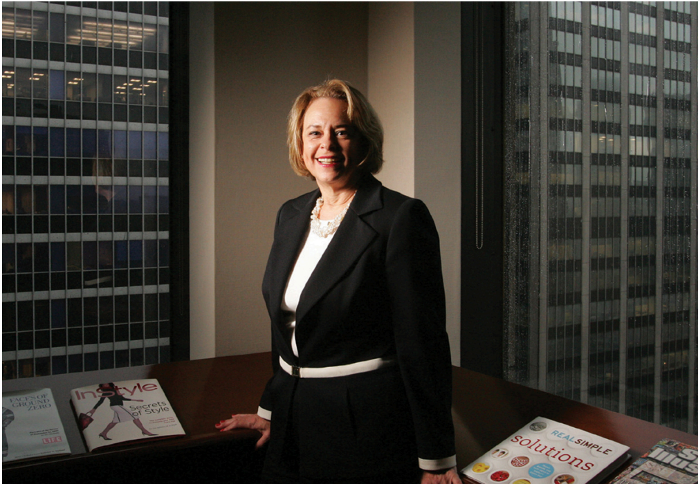
Figure 10.4: Ann S. Moore was appointed chairwoman and chief executive of Time Inc. in 2002, becoming its first female executive.