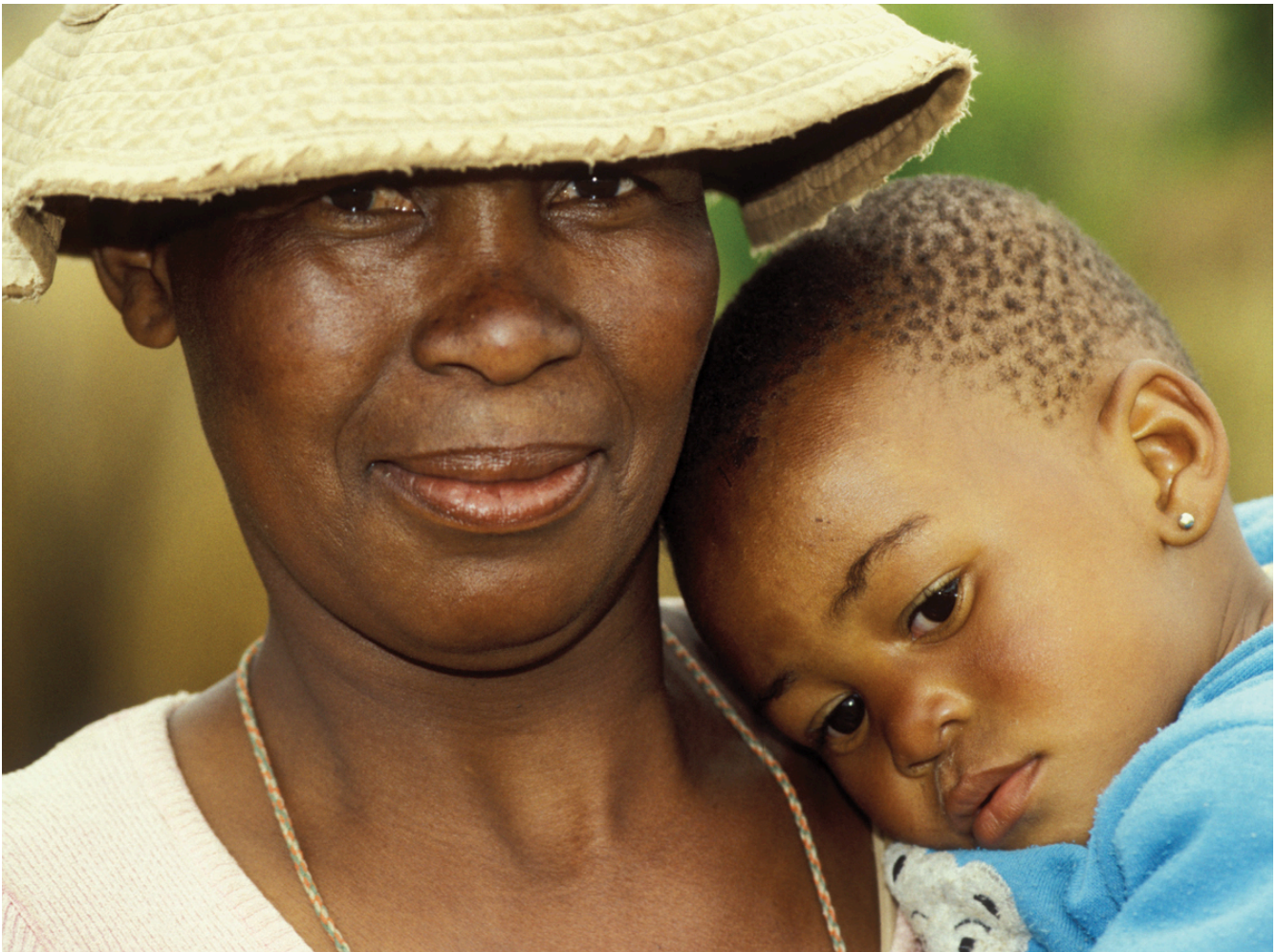
Figure 3.1: Healthy women are an asset to their families and society. They remain fit to care for their families, earn income and contribute to their communities. A woman and child in Botswana.