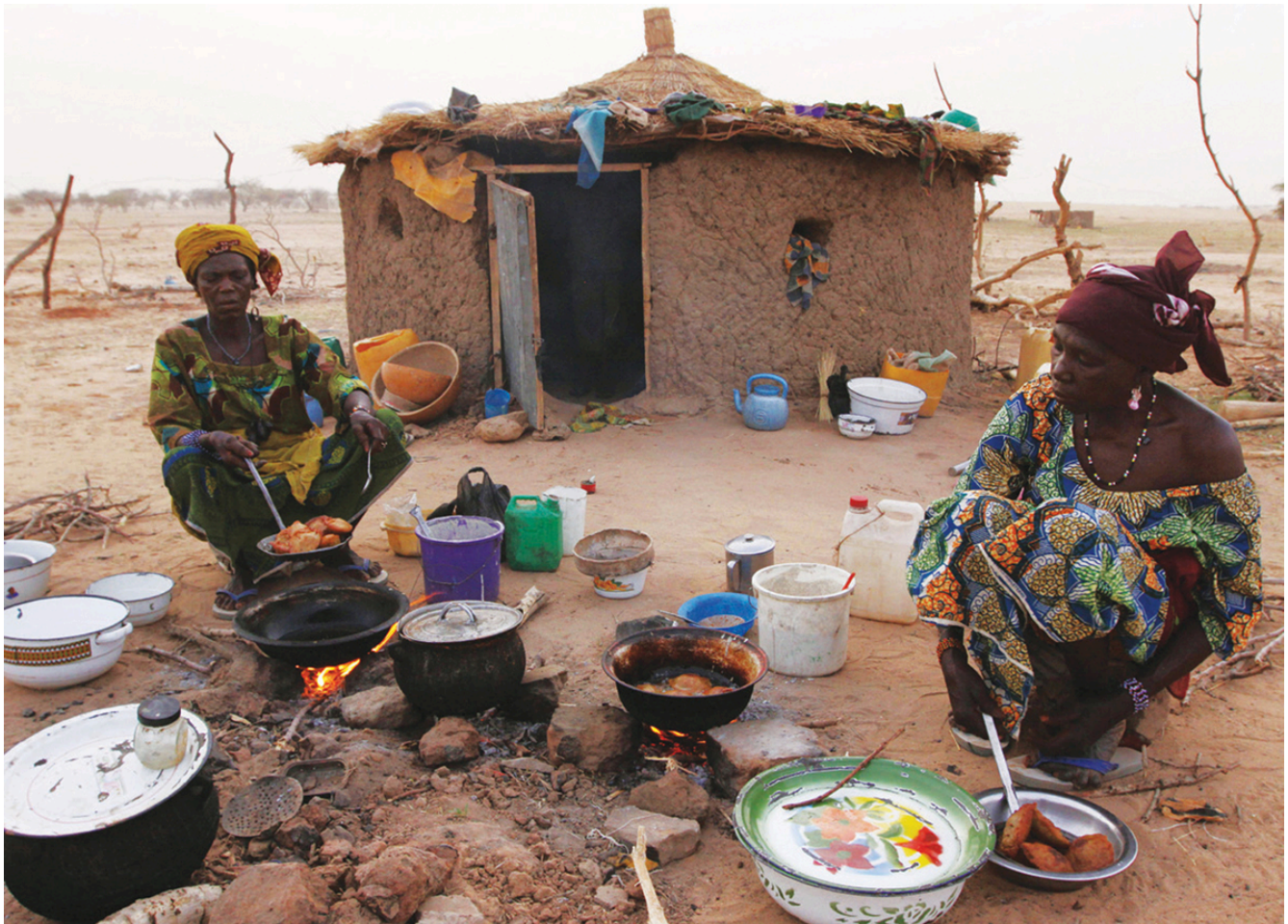
Figure 1.3: Women in Gadabeji, Niger, cope with a food crisis created by drought. Worldwide, women are driven further into poverty by inflated food prices.