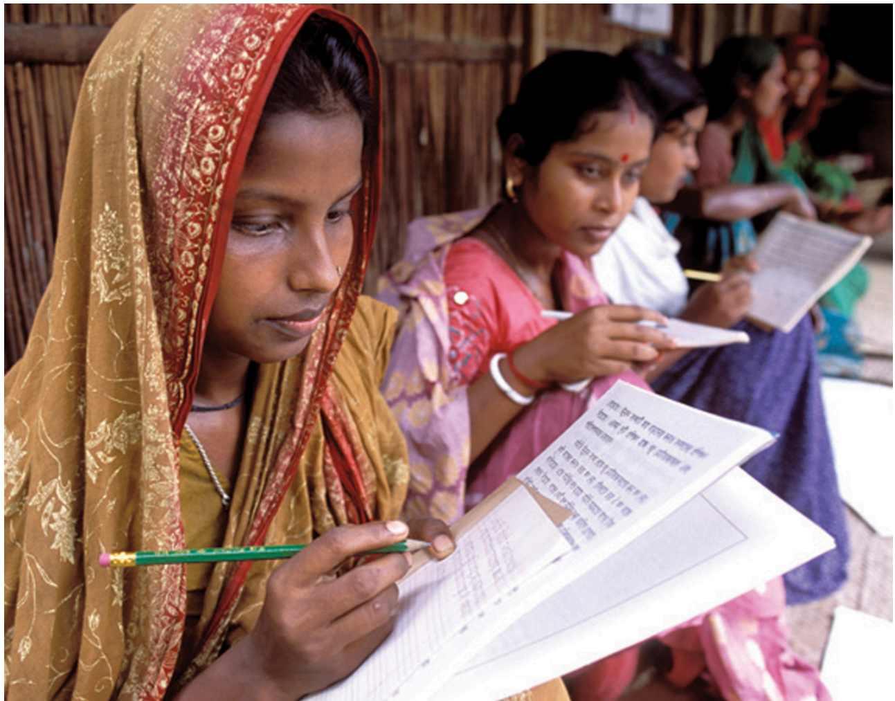
Figure 2.2: A woman in Bangladesh studies in an adult literacy class in a rural village. The teacher is from the village and trained at a college nearby.

teachers and girls' safety away from home. Governments and communities have begun to break down these barriers, however, because of overwhelming evidence of the benefits of educating girls.