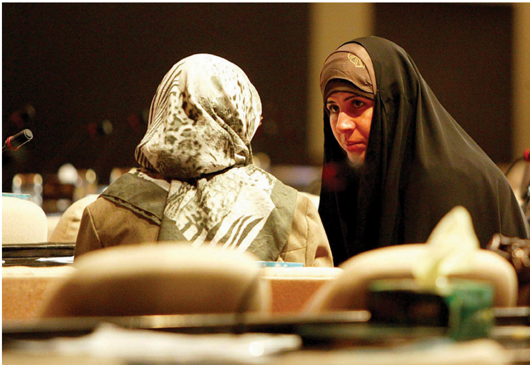
Figure 8.2: Iraqi women deputies converse at a session of parliament in Baghdad. Women's presence in government can help empower women generally.

In the U.N. system, four different offices deal with issues of gender equality: the Division for the Advancement of Women (DAW), U.N. Development Fund for Women (UNIFEM), International Research and Training Institute for the Advancement of Women (INSTRAW) and the Office of the Special Adviser on Gender Issues and the Advancement of Women (OSAGI). They exist alongside the Commission on the Status of Women (CSW), created by the U.N. Economic and Social Council in 1946, whose annual meetings define and elaborate on U.N. policy on women and gender. In 2010, the U.N. General Assembly voted unanimously to create the U.N. Entity for Gender Equality and the Empowerment of Women (U.N. Women) to merge the efforts of DAW, UNIFEM, INSTRAW and OSAGI to accelerate progress toward the achievement of women's human rights in all areas. This step was justified on the grounds that gender equality is not only a basic human right, but also spurs economic growth.