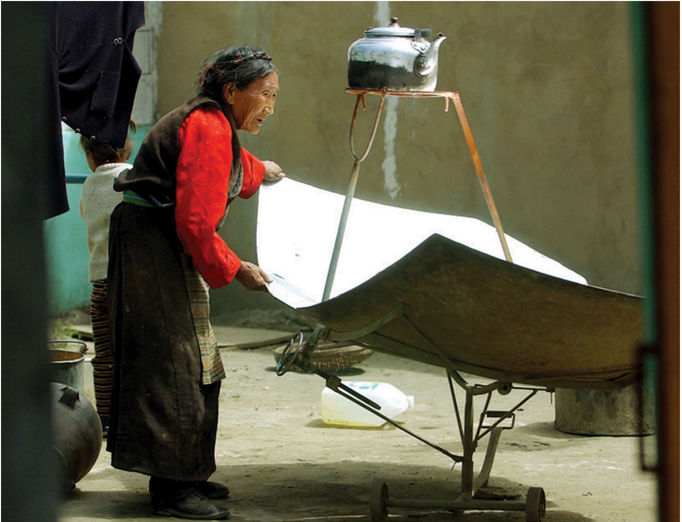
Figure 11.3: A woman in Tsetan, Tibetan Autonomous Region, China, uses a home-made solar cooker to boil water.

These international agreements indicate that, worldwide, women must be equal participants in all decisions related to their environment. Demonstrating great capacity as leaders, experts, educators and innovators, women and women's movements have made great strides in preserving and protecting the resources around them. Women took the lead in the grass-roots Chipko Movement of India in the 1970s, where activists stopped the felling of trees by physically surrounding — literally hugging — the trees. They also protected water sources from corporate control. Similarly, the Green Belt Movement, the conservation and forestry movement which originated in Kenya on Earth Day in 1977, is another famous effort initiated by women. Women around the world continue the fight against climate change, making sustainable consumption choices, and improving access to, control over and conservation of resources. Their voices must continue to be comprehensively integrated into policy and implementation efforts at every stage for the well-being of future generations.