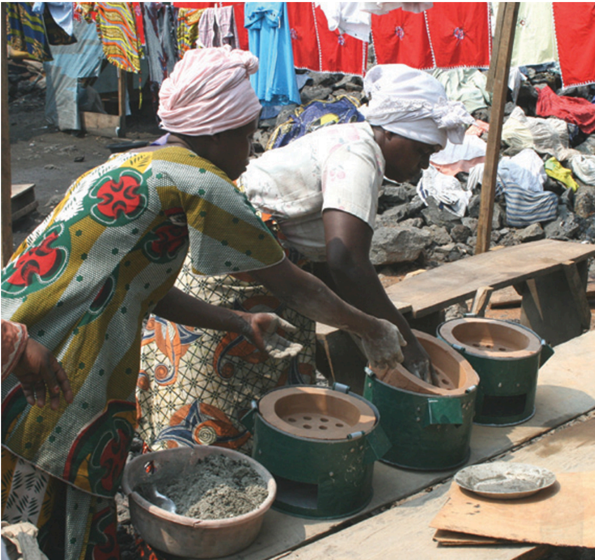
Figure 11.2: Locally built energy-efficient cookstoves help women manage resources sustainably and preserve Virunga Park forests in the Democratic Republic of Congo. USAID partners with WWF to support such ventures.

Women in the developing world are predominantly responsible for management and conservation of resources for their families. Women spend vast amounts of time collecting and storing water, securing sources of fuel, food and fodder, and managing land — be it forest, wetlands or agricultural terrain. As women are primary caregivers to children, the elderly and the sick, whole communities rely on them. Their traditional and generational knowledge of biodiversity, for example, supplies communities with medicines, nutritional balance and crop rotation methods. When drought, erratic rainfall or severe storms affect access to these basic resources, women’s lives — and their families’ lives — can be intensely affected. In fact, studies have shown that natural disasters disproportionately hit women, lowering female life expectancy rates and killing more women than men, especially where levels of gender equality are low.