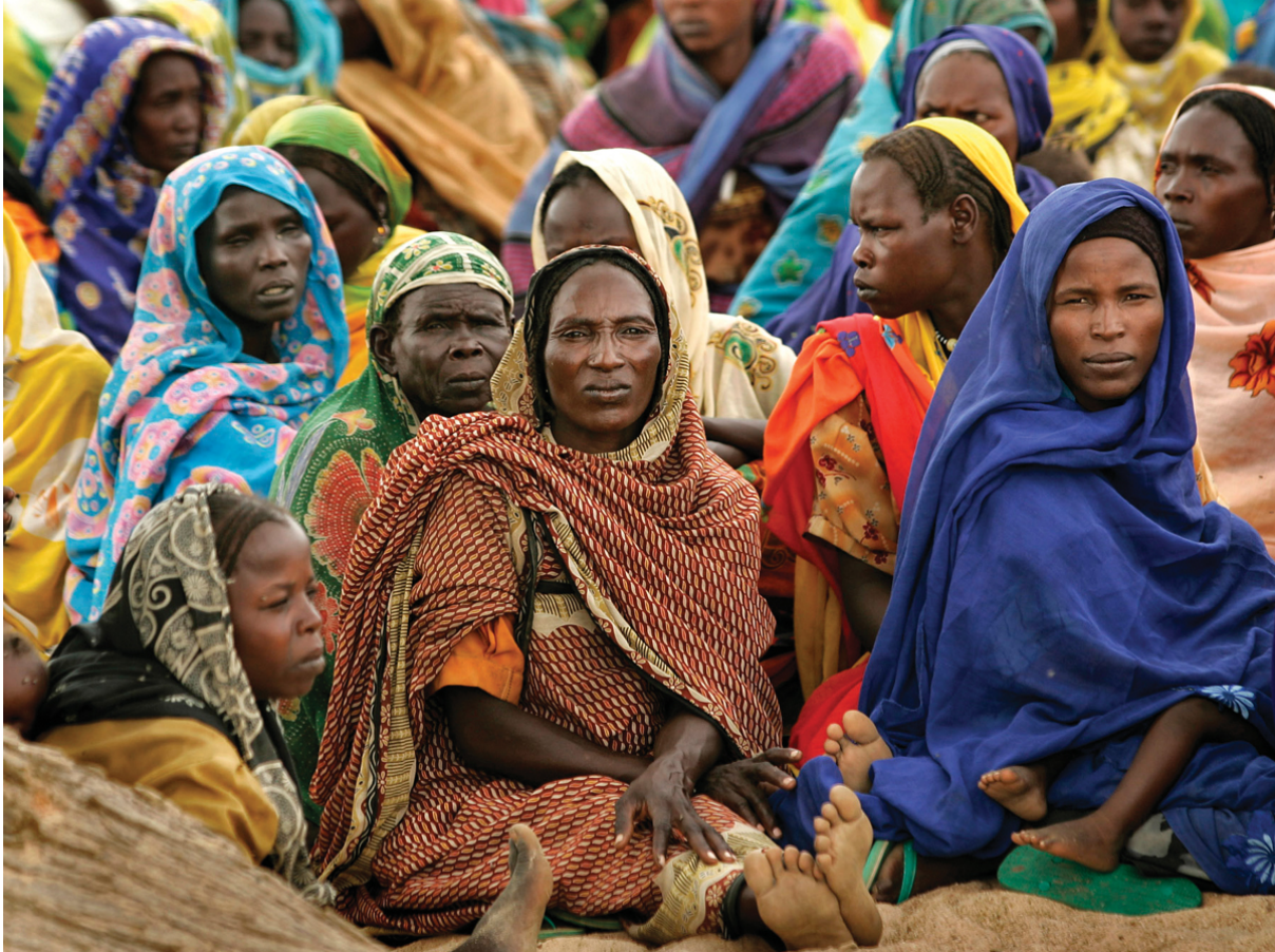
Figure 5.1: Armed conflict disrupts families and has significant negative consequences for women. Although they are victims of war, they may also be agents of peace. Displaced Sudanese women, driven from their villages by Janjaweed militia, shelter at the Abu Shouk refugee camp in Darfur, Sudan.