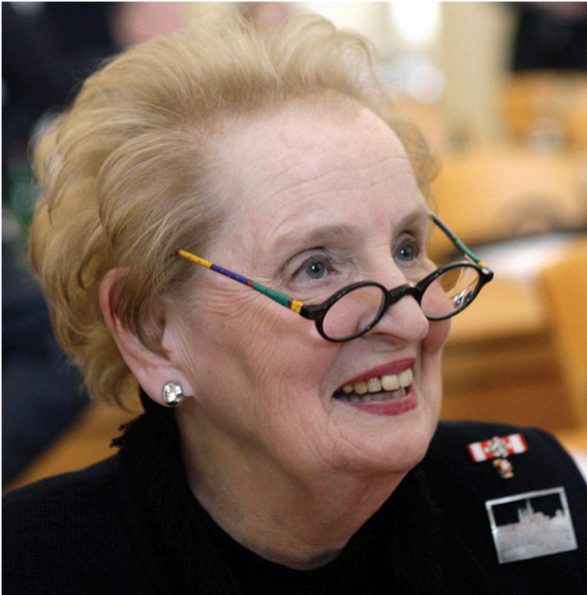
Figure 7.5: Former U.S. Secretary of State Madeleine Albright was instrumental in founding the Ministerial Initiative of the Council of Women World Leaders.

The Ministerial Initiative on the Environment was created to address the critical need to foster sustainable development policies. The council noted in 2009 that women have primary responsibility for raising children and for securing sufficient resources for their families' nutrition and health. So logic dictates that women's involvement in environmental issues should increase. Given the variety of their daily interactions with the environment, women are the most keenly affected by its degradation. Yet women are severely underrepresented at decisionmaking tables on development and the environment.