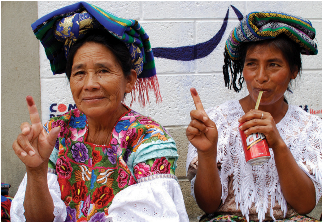
Figure 7.2: Women in rural El Quiché, Guatemala, display their inked fingers, proof they voted.

such as Kyrgyzstan in 2007, 30-percent quotas have been adopted as part of election reform. In Kuwait in 2005, the all-male parliament granted women full political rights — a small but significant step in the Arab world. Many other countries have reserved seats for women on local village councils and governing bodies. In India in recent years, some states have increased the quota for women in these bodies from 30 percent to 50 percent.