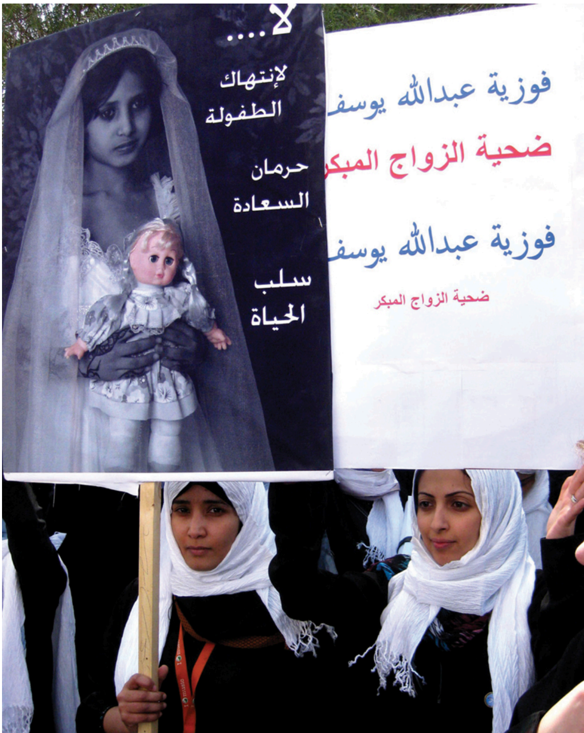
Figure 12.5: Yemeni schoolgirls in Sana'a carry signs denouncing child marriage, a practice still common in Yemen.

The volunteers raise awareness about the social and health consequences of child marriage through lively discussions, film screenings, plays, writing competitions, poetry readings, debates and literacy classes. One of their main lessons is about the healthy timing and spacing of pregnancy. The messages about family planning are tailored to be appropriate for Islamic communities, and encourage girls not to get pregnant for the first time until they are at least 18.