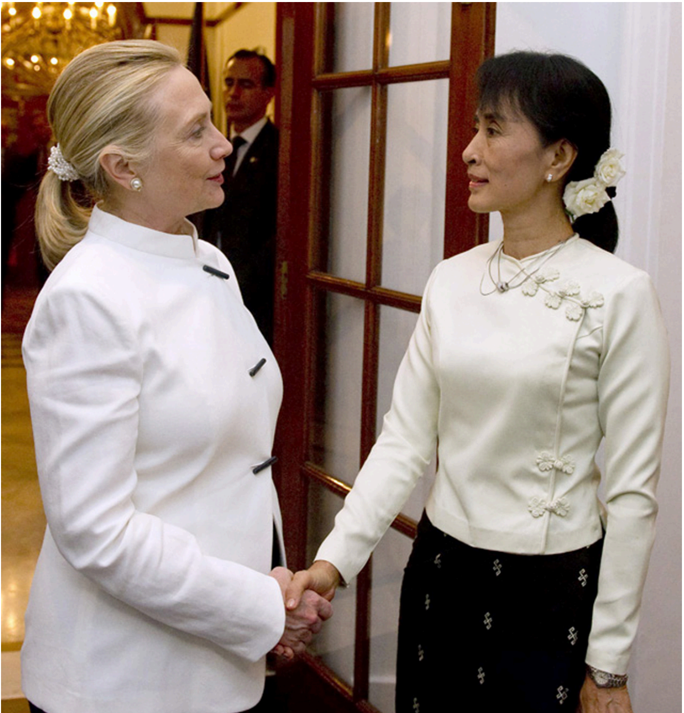
Figure 0.1: U.S. Secretary of State Hillary Rodham Clinton meets Burmese pro-democracy leader Aung San Suu Kyi in Rangoon, Burma, in 2011. Suu Kyi, awarded the Nobel Peace Prize (1991), spent nearly 20 years under house arrest. Released in 2010, she has engaged with the ruling military junta on reforms. She and members of her National League for Democracy won parliamentary seats in 2012 by-elections.

At the State Department, we believe elevating the status of women and girls in their societies is not only the right thing to do, it is also the smart thing to do. Women and girls are often a community's greatest untapped resource, which makes investing in them a powerful and effective way to promote international development and our diplomatic agenda.