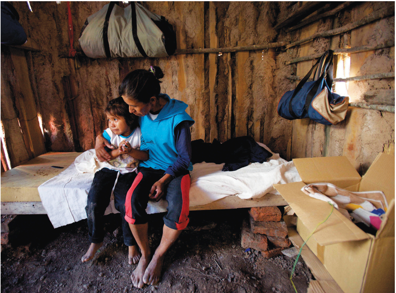
Figure 1.1: Women constitute a majority of the poor and are often poorest of the poor. A woman hugs her granddaughter in their shack near Castelli, Chaco, Argentina.

Women constitute a majority of the poor and are often the poorest of the poor. The societal disadvantage and inequality they face because they are women shapes their experience of poverty differently from that of men, increases their vulnerability, and makes it more challenging for them to climb out of poverty. In