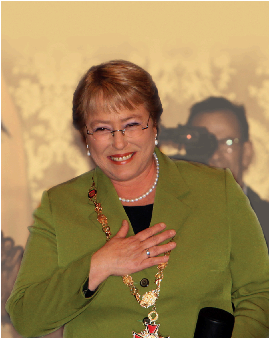
Figure 7.3: Courage, commitment and circumstance propelled this physician turned politician into becoming the first woman president of Chile. Now she works for international gender equality.

Self-professed agnostic. Divorced mother of three. Amateur folksinger. That’s hardly a recipe for political success in a country as devoutly religious and socially conservative as Chile.