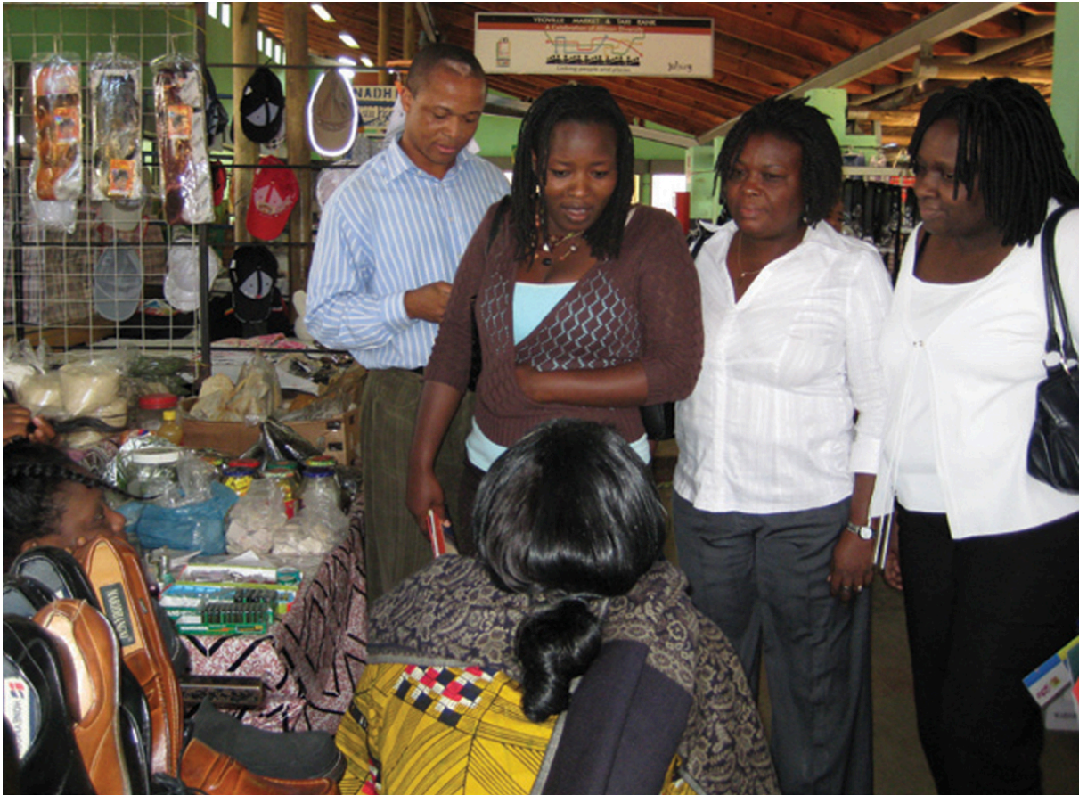
Figure 10.6: Three Women's Edition journalists accompany an activist doing HIV/AIDS outreach in a Johannesburg, South Africa, market as part of a project to stop violence against women.

In organizing the seminars, PRB seeks input from the journalists in selecting a topic and then links the topic with a relevant venue. For example, a seminar on trafficking was held in New Delhi, where the journalists visited a brothel in the city's largest red-light district and talked to Nepali sex workers there who had been trafficked years before. For a seminar on violence against women, Women's Edition met in South Africa, which has one of the world's highest rates of rape but also some of the most innovative programs to deal with the problem. Some seminars have been held in conjunction with international conferences and other events, such as the biennial AIDS conferences and special U.N. sessions. Other seminar themes have included links between gender and the environment, women's empowerment and women's reproductive health.