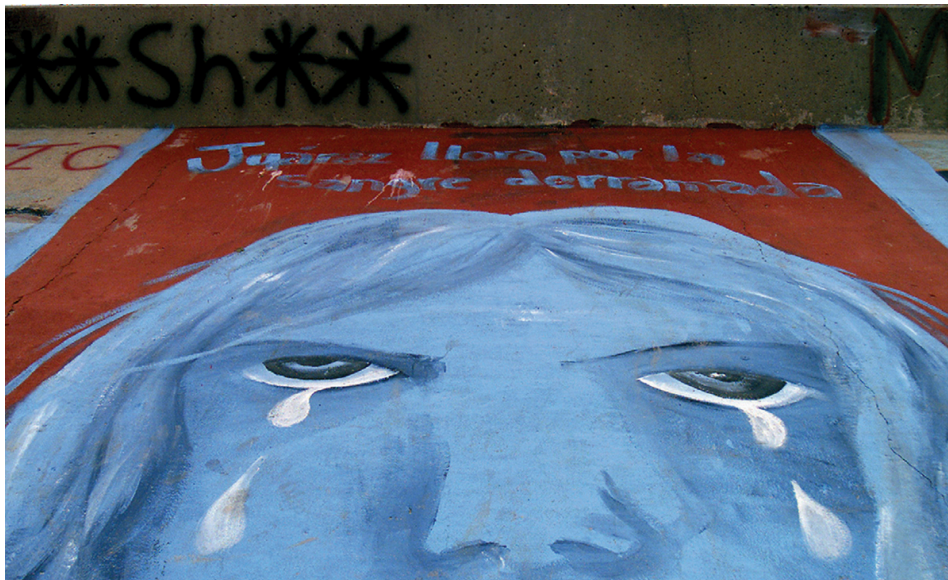
Figure 9.2: A mural near Ciudad Juárez, Mexico, commemorates hundreds of women who were murdered and left in the desert near that city.

The Convention on the Elimination of All Forms of Discrimination Against Women (CEDAW), a key international agreement on women’s human rights, was adopted by the United Nations General Assembly in 1979. CEDAW is often described as an international bill of rights for women. Its preamble and 30 articles aim to eliminate gender discrimination and promote gender equality. The convention defines discrimination against women as “any distinction, exclusion or restriction made on the basis of sex” that impedes women’s “human rights and fundamental freedoms in the political, economic, social, cultural, civil or any other field.” It sets an agenda for national action to end such discrimination, requiring all parties to the convention to take “all appropriate measures, including legislation, to ensure the full development and advancement of women” and guarantee their fundamental freedoms “on a basis of equality with men.”