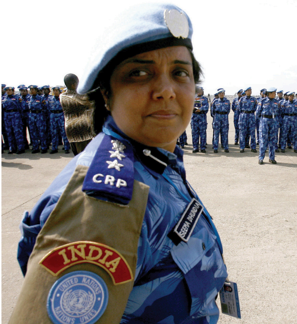
Figure 5.6: A member of the United Nations first all-female peacekeeping force stands guard with fellow officers after arriving at the Monrovia, Liberia, airport.

The United Nations' ultimate goal is gender parity in the civilian, military and police sectors, but, globally, women make up just 8.2 percent of roughly 13,000 U.N. police and only two percent of military police.