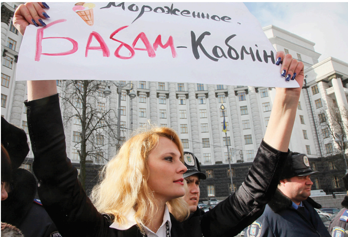
Figure 8.4: An activist from the Ukrainian women's organization FEMEN in Kyiv protests the all-male government formed in 2010. The posters read "Give a portfolio!"