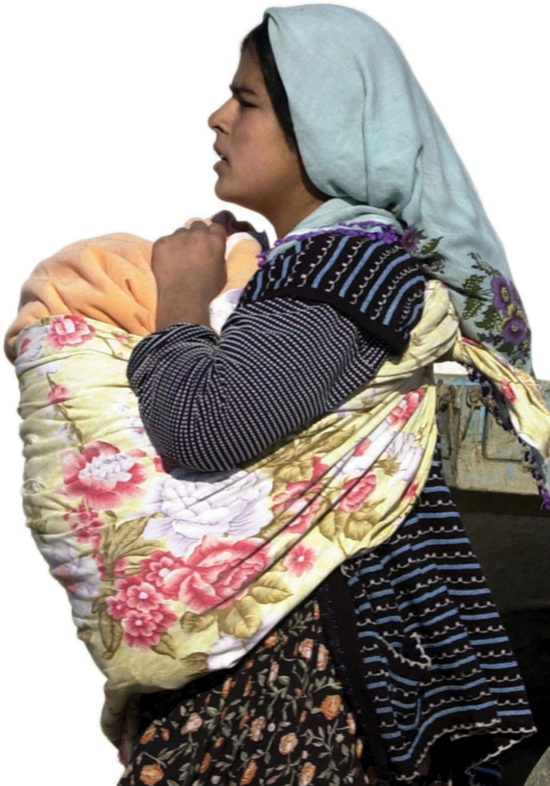
Figure 12.2: Turkish authorities discourage the traditional practice of child marriage in rural towns such as Acarlar, where this young woman walks with a baby.

Girls are more likely to be denied education. In 2007, an estimated 101 million children worldwide — the majority of whom were girls — did not attend primary schools (UNICEF, 2010). Africa, the Middle East and South Asia have the largest gender gaps in education. Girls from poor and rural households are especially likely to be denied education. Knowledge and skills needed for employment, empowerment