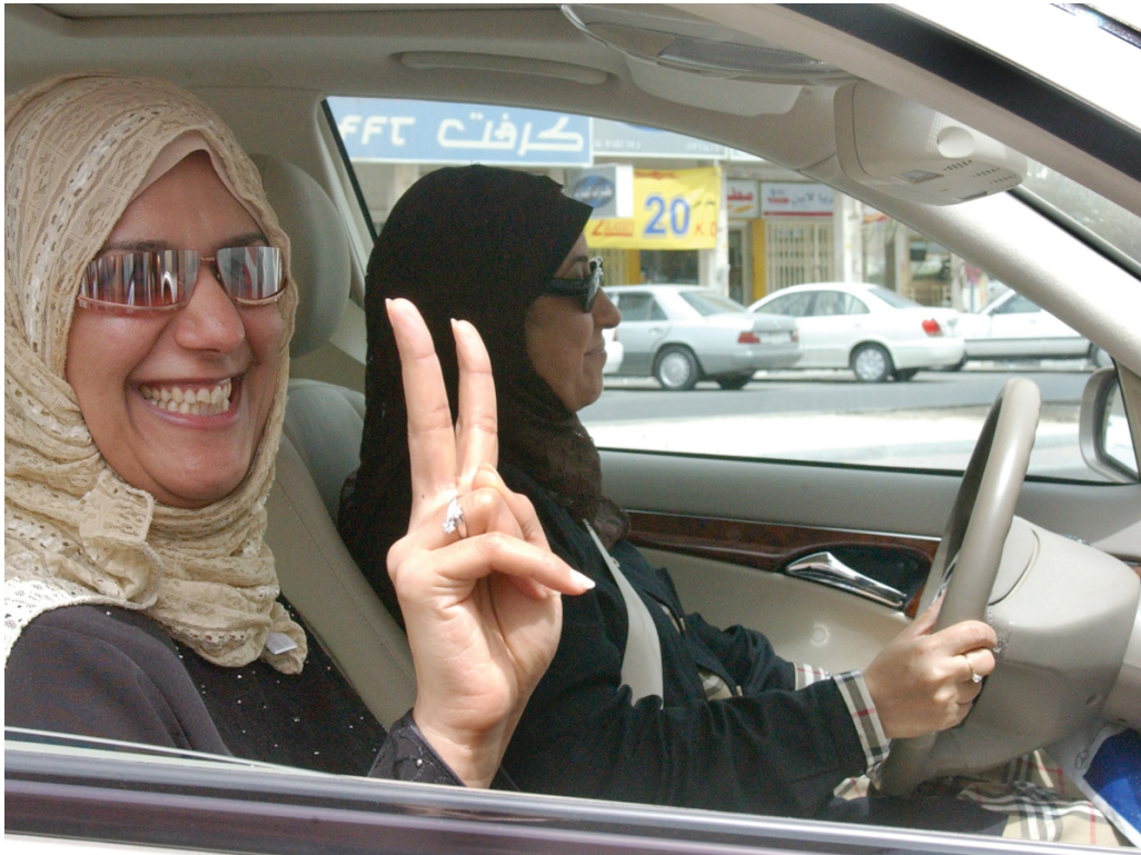
Figure 7.1: Women make significant contributions to civil society, yet around the world their representation in government is limited. Here a Kuwaiti woman flashes the victory sign in Kuwait City after their parliament, in May 2005, passed a historic law that allows women to participate actively in politics.