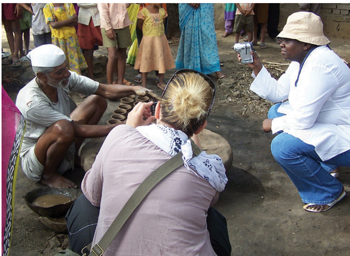
Figure 10.5: In India, two Women's Edition journalists photograph a village potter.

The Population Reference Bureau (PRB), a nongovernmental organization in Washington that runs the project, solicits applications from women editors, reporters and producers every two years. Journalists hear about this from national and international journalism associations, schools and websites. As many as 200 candidates apply. PRB invites around 12 to participate. PRB looks for seasoned journalists who demonstrate a strong interest in women's health and development issues and who have editorial influence in their newsrooms. To maintain geographic diversity, usually just one journalist is selected from a country.