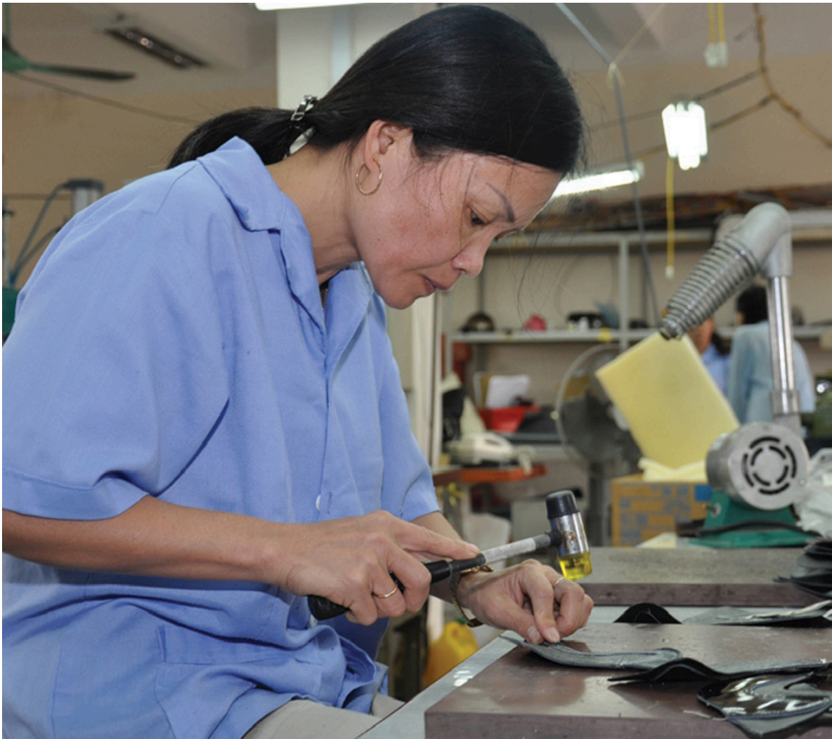
Figure 6.2: A designer at the Leather and Shoe Research Institute in Hanoi, Vietnam, works to improve Vietnamese shoemakers' product lines and competitive edge.