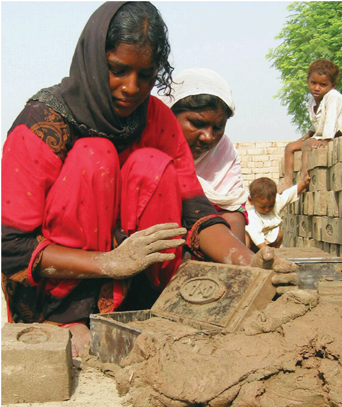
Figure 1.2: Pakistani women are paid about US$2 for every 1,000 bricks they make at this brick kiln in Multan, Pakistan.