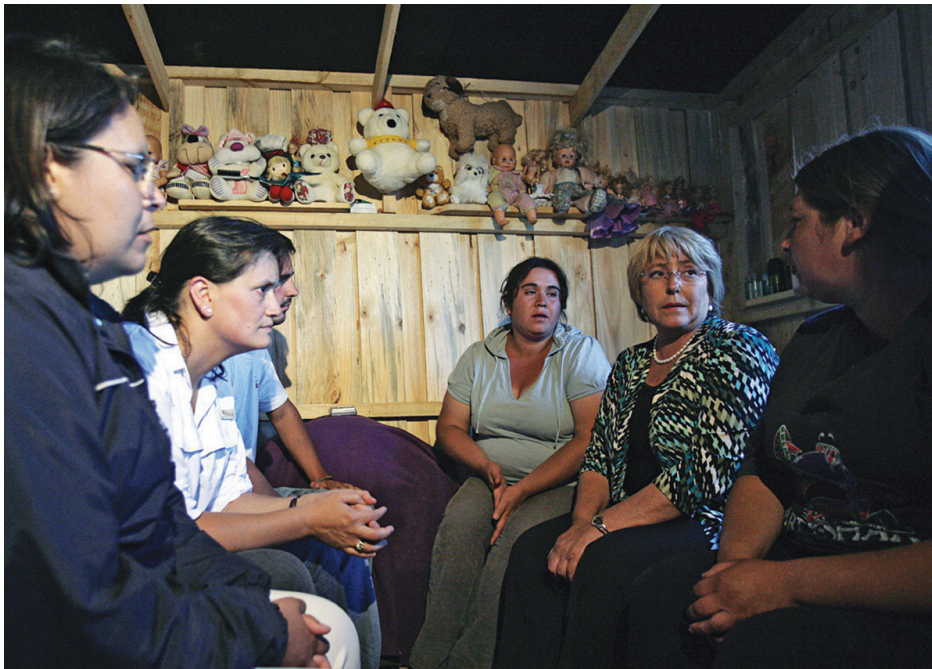
Figure 7.4: President Bachelet speaks with a family affected by the 2010 earthquake and tsunami in Constitución, Chile.

Bachelet didn’t let this deter her own political participation. Instead, she stepped up her commitment as a member of the Socialist Youth Movement. But her activities were curtailed when both she and her mother were detained at torture centers by the Pinochet regime before they fled the country for Australia in 1975.