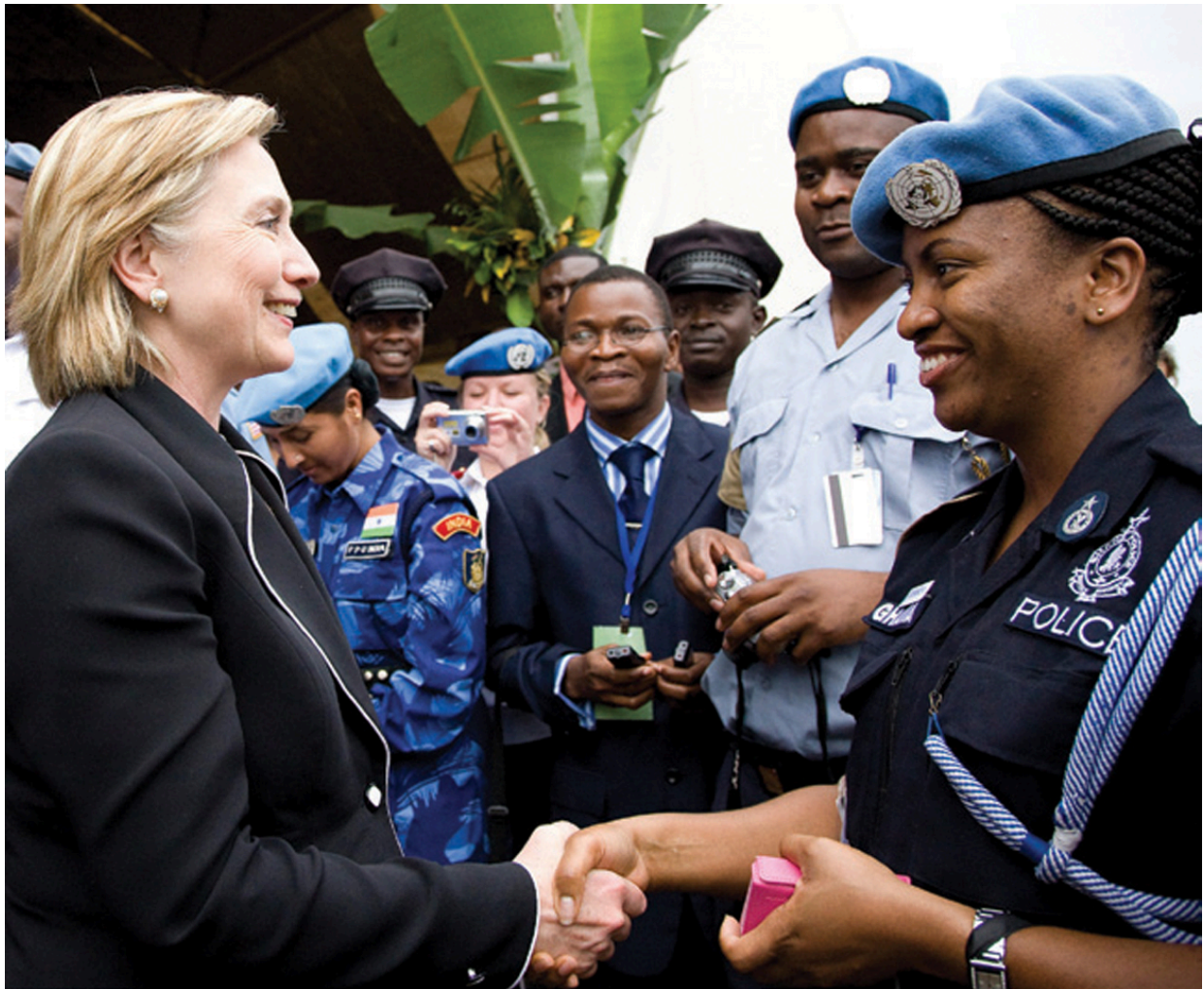
Figure 5.7: Secretary of State Hillary Rodham Clinton greets a U.N. peacekeeper in Monrovia. Clinton has strongly supported Liberian President Ellen Johnson Sirleaf in promoting democracy and development. In 2010 USAID invested more than $11 million in programs for women’s empowerment.

India’s all-female unit has inspired Bangladesh and Nigeria to create their own, while countries such as Rwanda and Ghana also are ramping up their female troop contributions to U.N. missions. Back at the Indian headquarters in Monrovia, Arjunan talks to her new husband over the Internet, using a webcam, for at least an hour every day. Although she’s a little homesick, Arjunan says she is proud to follow in the footsteps of other courageous women in India’s history.