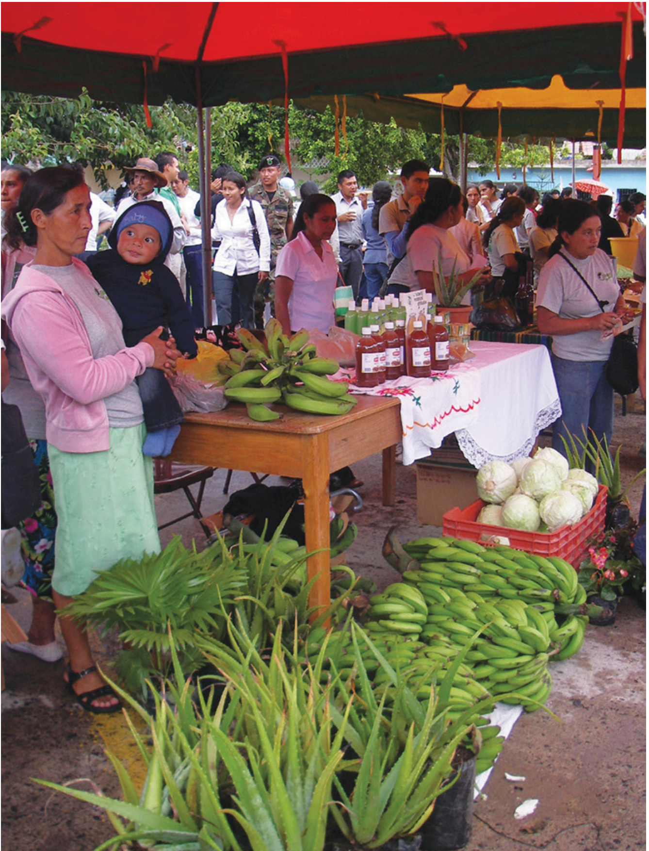
Figure 1.7: COMUCAP members sell their produce and other products at a local market. Their organic products are