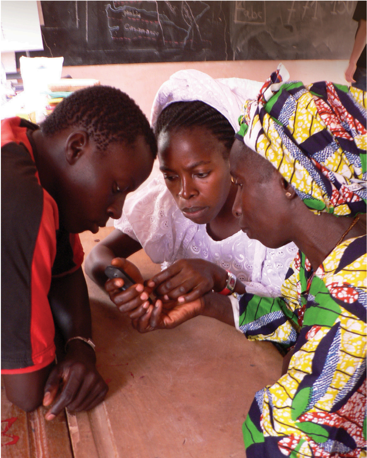
Figure 2.6: The Tostan Jokko community empowerment program teaches women to use mobile phones.

Outside of the classroom, students circle around a strange arrangement of sticks. With a little explanation, the sticks come to represent a mango tree. Khady, age 52, walks along the “tree branches” and stops at each fork where signs are placed: Contacts, Search, Add Contact. This activity teaches