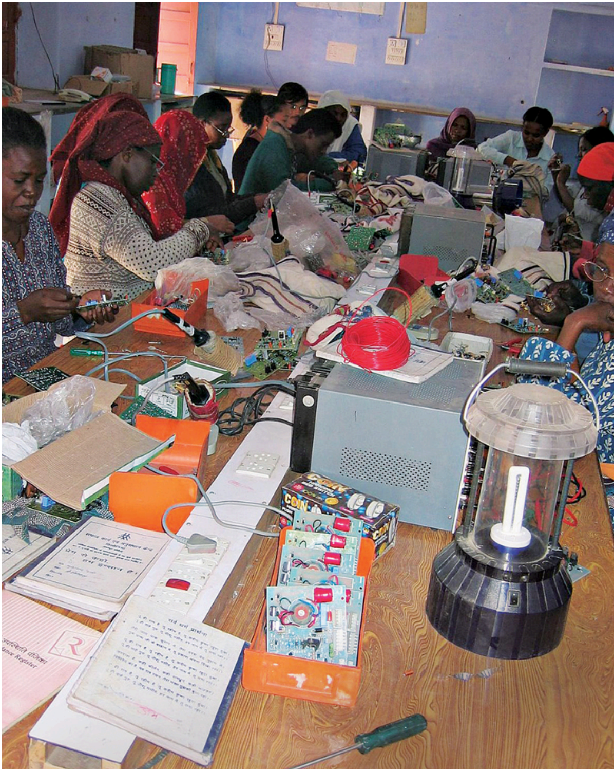
Figure 11.5: Rural grandmothers are being trained as solar engineers at a Barefoot College workshop session.

The extraordinary results achieved by Barefoot College began with its six-month, hands-on solar engineering training program. The guiding principle of the college, that solutions to rural problems lie within the community, is nowhere more evident than at a solar engineering training classroom, where 30 participants, from various countries, sit side by side on benches, working with concentration to connect wires on a circuit board, assemble a solar lantern or draw what they have just created in a small