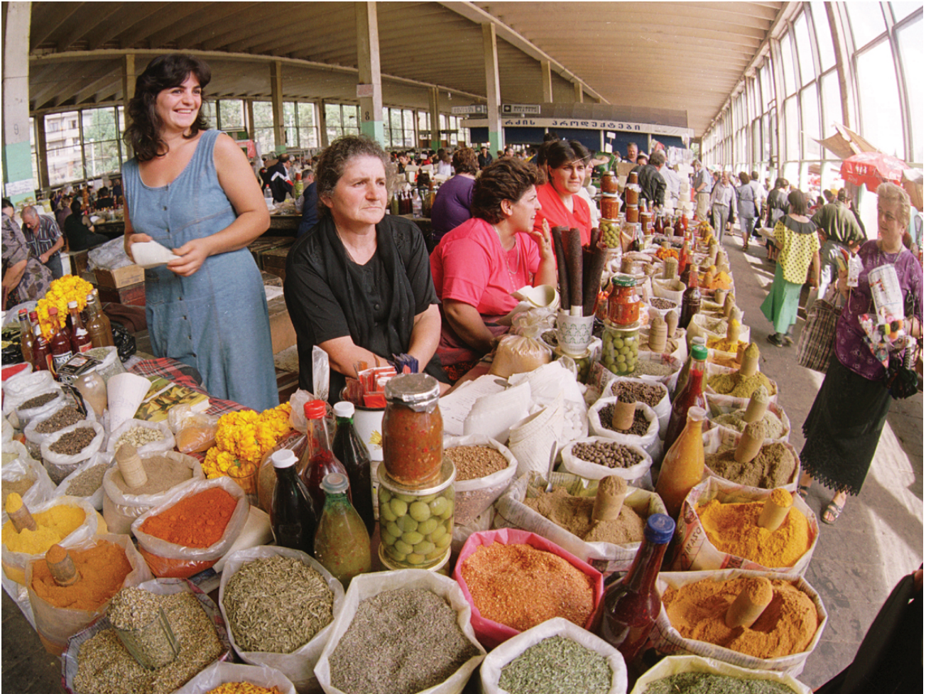
Figure 6.1: A small loan allowed this woman to go into business selling spices in a Tbilisi neighborhood market.