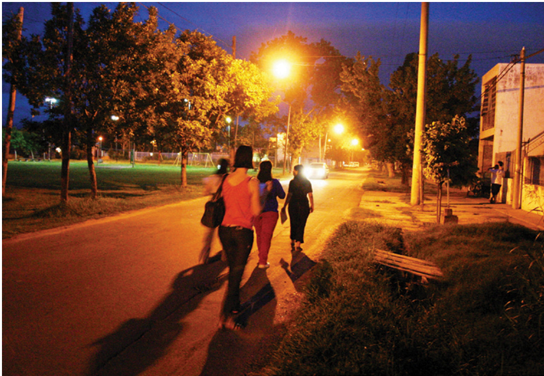
Figure 9.5: Women and girls conduct a “safety audit” walk to identify dangerous areas in their Rosario, Argentina, neighborhood.