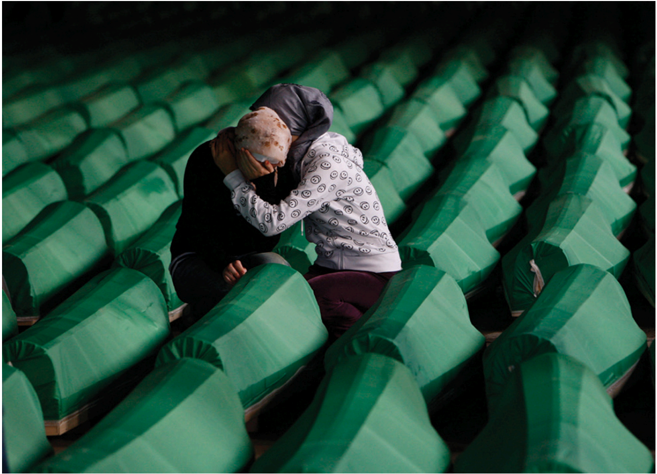
Figure 5.3: Bosnian Muslim women grieve among coffins of victims of the 1995 Srebrenica massacre. The remains were unearthed in 2010. The massacre shattered lives of widows and families of the 8,000 killed by Bosnian Serb troops in 1995.

The specific experience of women and girls in armed conflicts greatly depends upon their status in societies before armed conflict breaks out. Where cultures of violence and discrimination against women and girls exist prior to conflict, these abuses are likely to be exacerbated during conflict. Similarly, if women are not allowed to be part of decisionmaking before conflict, it is usually extremely difficult for them to become involved in decisions during the conflict itself or the peace process and post-conflict period. Thus, gender relations in pre-conflict situations as shaped by ethnicity, class, caste and age often set the stage for women's and girls' experiences and options during and after armed conflict.