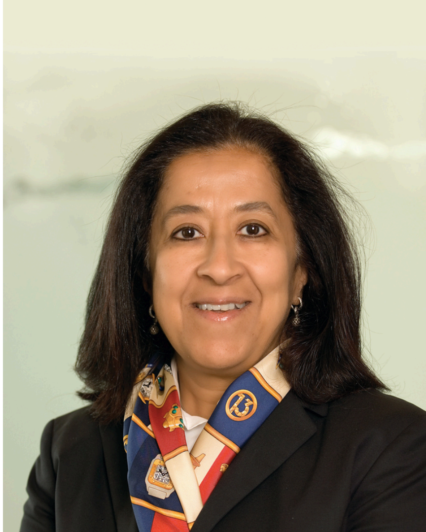
Figure 6.3: As head of the Olayan Financing Company, Lubna Olayan oversees the operations of dozens of international firms. But what many people don't know is that the Cornell University graduate is dedicated to building her society by working with grassroots organizations throughout the Arab world.

Lubna Olayan is known in Saudi Arabia and around the world for her business acumen. The chief executive of the Olayan Financing Company, Olayan oversees the workings of more than three dozen companies with operations both inside and outside the kingdom. But Olayan, selected by Time magazine in 2005 as one of its top 100 most influential people, has a side to her that goes beyond business. When she is not running companies, she empowers communities by working with and supporting nongovernmental organizations.