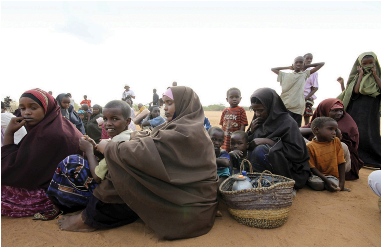
Figure 5.2: Somali women gather with their children at the Dadaab refugee camp in Eastern Kenya.

There is a growing body of evidence (ICRC 2001, UNIFEM 2002) that the long-term impact of armed conflict on women and girls may be exacerbated by their social vulnerability. The harm done to women and girls during and after armed conflict is significant, and often exposes them to further harm and violence. Gender-based and sexual violence such as rape, forced marriage, forced impregnation, forced abortion, torture, trafficking, sexual slavery and the intentional spread of STDs, including HIV/AIDS, are weapons of warfare integral to many of today's conflicts. Women are victims of genocide and enslaved for labor. Women and girls are often viewed as culture bearers and reproducers of "the enemy" and thus become prime targets. Women are exploited because of their maternal responsibilities and attachments, which heighten their vulnerability to abuse.