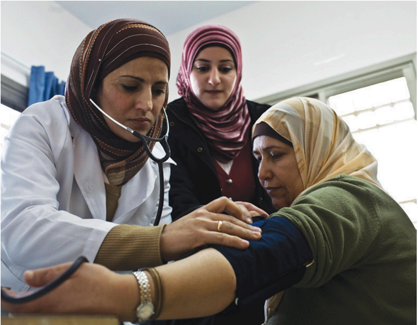
Figure 3.5: A nurse in a West Bank community clinic examines patients. The clinic is part of USAID’s Health Flagship Project to improve community health care.