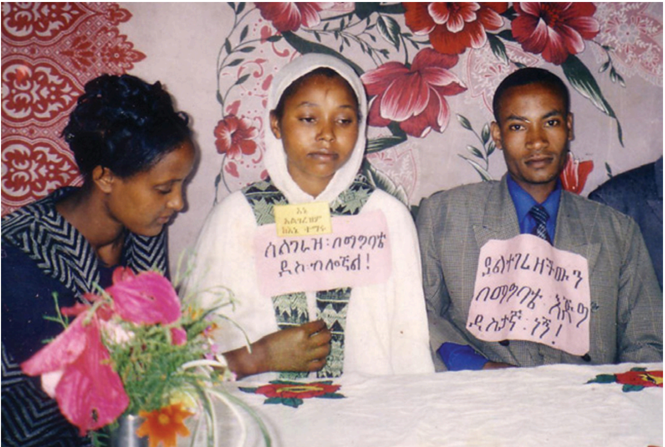
Figure 12.4: An Ethiopian couple celebrates their wedding wearing signs declaring their opposition to female genital mutilation.

Today, female genital mutilation has been largely eliminated in KMG’s outreach area of 1.5 million people. A 2008 UNICEF study documents the transformation after a decade of intervention in which female circumcision has dramatically decreased to less than 3 percent. This has been accomplished by law and through education of communities about the harm of the practice.