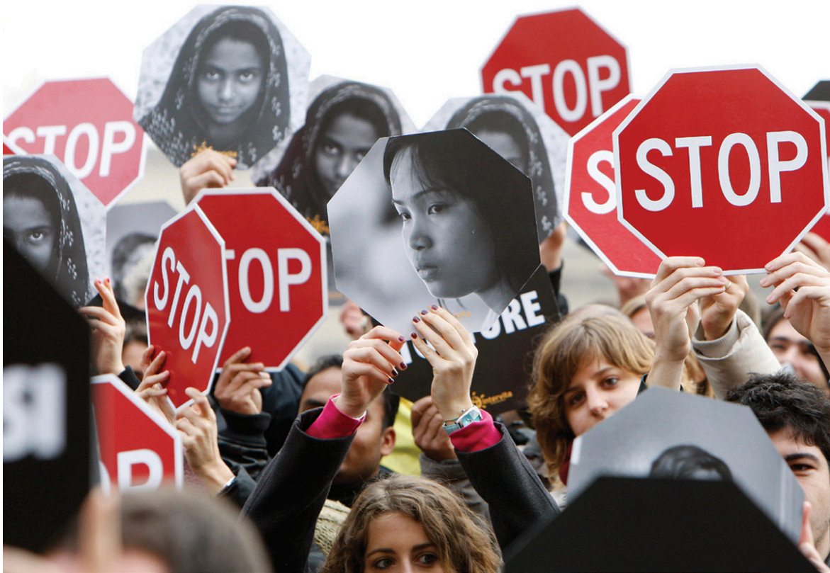
Figure 4.2: Women holding portraits of victims protest violence against women in Milan, Italy.

International research, conducted over the past two decades by the World Health Organization and others, reveals that violence against women is a much more serious and common problem than previously suspected. It is estimated that one out of three women worldwide has been raped, beaten or abused. While violence against women occurs in all cultures and societies, its frequency varies across countries. Societies that stress the importance of traditional patriarchal practices which reinforce unequal power relations between men and women and keep women in a subordinate position tend to have higher rates of violence against women. Rates tend to be higher in societies in which women are socially regulated or secluded in the home, excluded from participation in the economic labor market and restricted from owning and inheriting property. It is more prevalent where there are restrictive divorce laws, a lack of victim support services and no legislation that effectively protects female victims and punishes offenders. Violence against women is a consequence of gender inequality, and it prevents women from fully advancing in society.