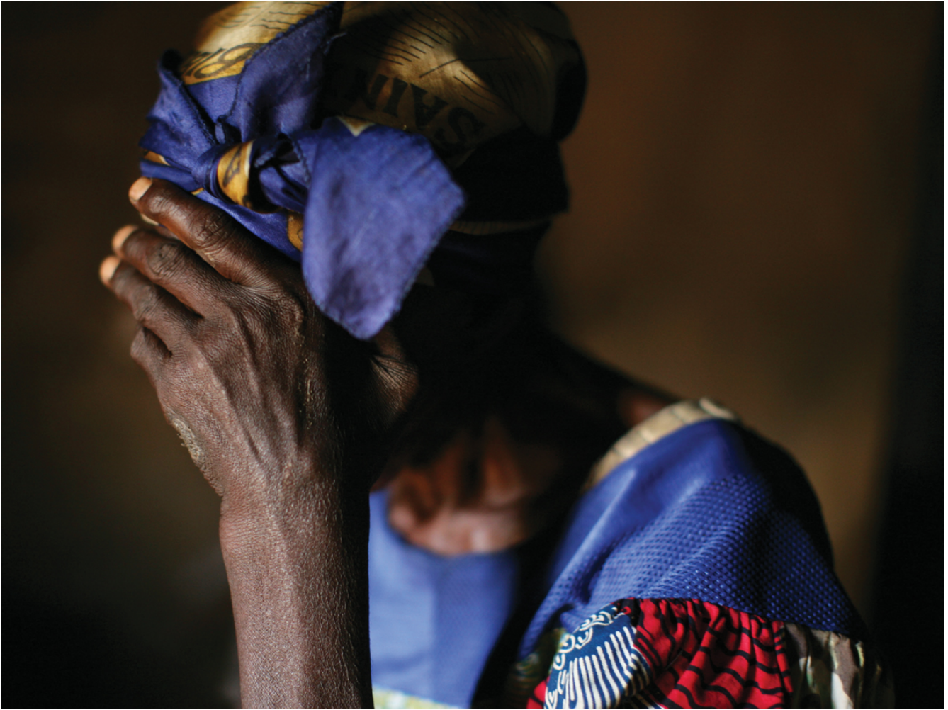
Figure 4.1: Violence against women is a serious and common problem worldwide. Women and children, trafficked for sex and slave labor, are particularly vulnerable in conflict zones. This woman was among hundreds raped when rebels attacked a village in the Democratic Republic of Congo.